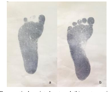
Figure 4: a, b. (a) Preoperatively printed out and (b) postoperative static and dynamic pedobarographic measurements of 12-year-old girl with symptomatic flatfoot. Loading of plantar foot shifted laterally after surgery