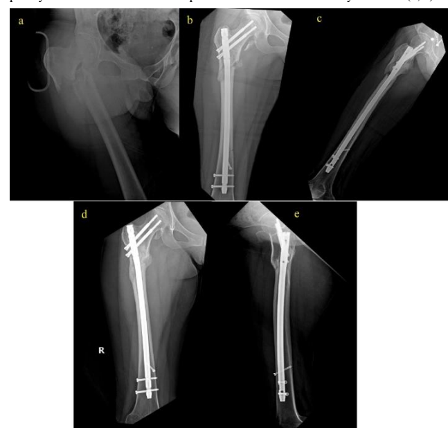
Figure 3: A 44-year-old male patient fell from a tree and presented to the emergency department with a Seinsheimer type 5 subtrochanteric femur fracture (a). His fracture was anatomically reduced using 3 cerclage cables and a Gamma Long nail was chosen as a fixation tool (b, c). At 7 months the patient is fully active and the fracture has healed without complications (d, e).