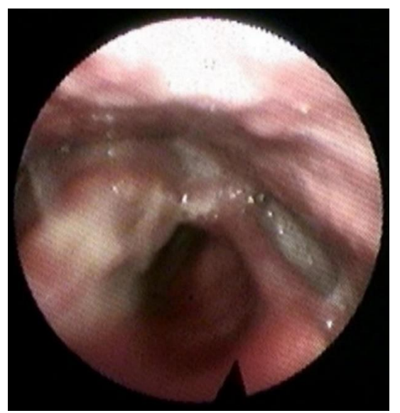
Figure 1: Flexible fiberoptic view of the larynx

After obtaining patient consent, direct laryngoscopy was performed under general anesthesia. On the laryngeal face of the epiglottis, there was a mass extending from the right epiglottic fold to the root of the tongue. A biopsy was obtained.