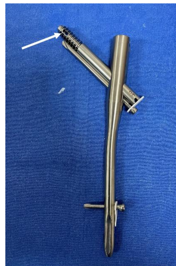
Figure 1: Design of cemented proximal nail. The white arrow indicates the holes at the tip of the lag screw.