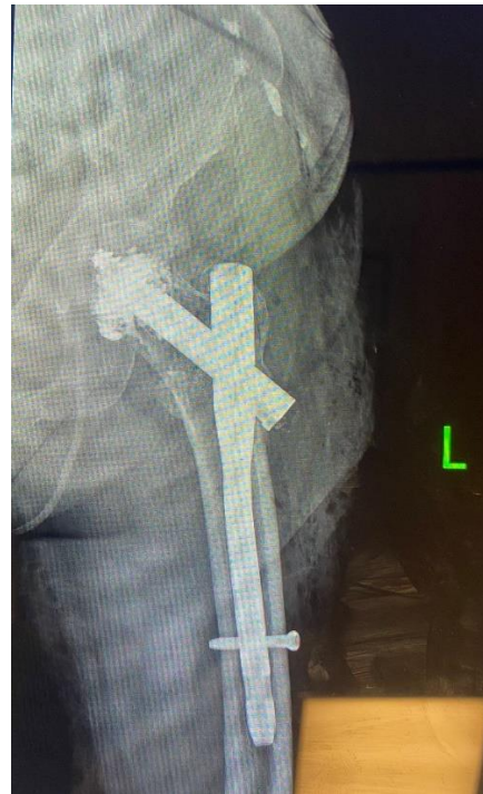
Figure 6: Pre- and postoperative radiologic images of a 69-year-old female patient.