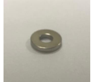
Figure 3: Image of circular mid-spaced magnet with a 15-mm diameter