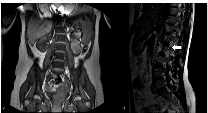
Figure 2: Coronal lumbar survey image (a) showing the scoliosis and T2-weighted sagittal image (b) of the same patient. Not all the vertebrae are on the same line because of scoliosis, also showing the suspected apex of the curvature (arrow).

Measurements were made on the Infinitt PACS system at the level of cross-sections between the lower limit of the L4 vertebrae and the upper limit of the L5 vertebra. Area measurements were calculated in mm<sup>2</sup> by drawing the psoas muscle limits manually using polygonal ROI. Anteroposterior (AP) diameter measurement was made such that it would pass through the midpoint of the sagittal plane of the psoas muscle, and the transverse diameter measurement was made such that it would pass through the middle section of the psoas muscle in the coronal plane (Figure 3). Measurements were made by the same radiologist twice, and the mean value of two measurements was used in statistical data.