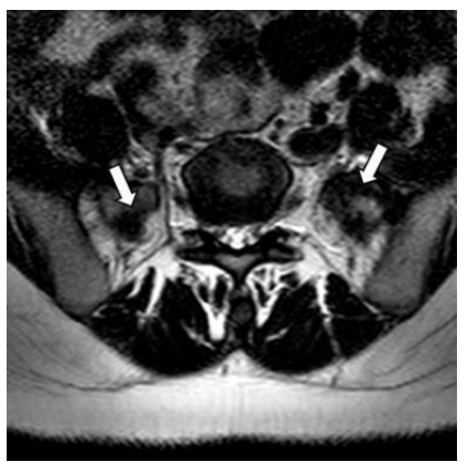
Figure 1: Bilateral sacralization and pseudoarticulation of L5 vertebra with sacrum is seen on axial T2-weighted MR image.

TE:10) with a 1.5 T Philips Achieva MRI device (Philips Healthcare, Best, The Netherlands). The images were evaluated at the workstation (INFINITT PACS, Infinitt Healthcare, South Korea) by a radiologist with >5 years of experience in spinal imaging. LSTV anatomy and type were determined based on full spine coronal plane localizer images and verified with the roentgenogram of the patients as well as with axial MR images by the presence of articulation, pseudo-articulation, or fusion of the fifth lumbar vertebra with sacrum (sacralization) (Figure 1). Coronal localizer images were evaluated for the presence of scoliosis and lumbar vertebral roentgenograms of patients were further checked for their Cobb angle measurement (Figure 2). Following the measurement, we determined the curvature type. Right-sided curvature of the scoliosis is called dextroscoliosis and its left-sided counterpart is levoscoliosis. Axial T2A MRI sections were used for psoas muscle area and diameter measurements.