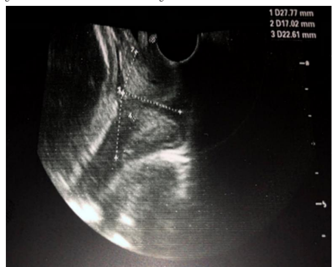
Figure 1: Cervical thickness measurement figure

Before oxytocin induction, we applied 10 mg of dinoprostone ovule vaginally in sustained release form to pregnant women with a stiff cervix, without dilatation and effacement. When regular uterine contractions started and dilatation of 4 cm occurred or after 12 h, the suppository was removed from the vagina. After a 1-h break, we switched to labor induction with