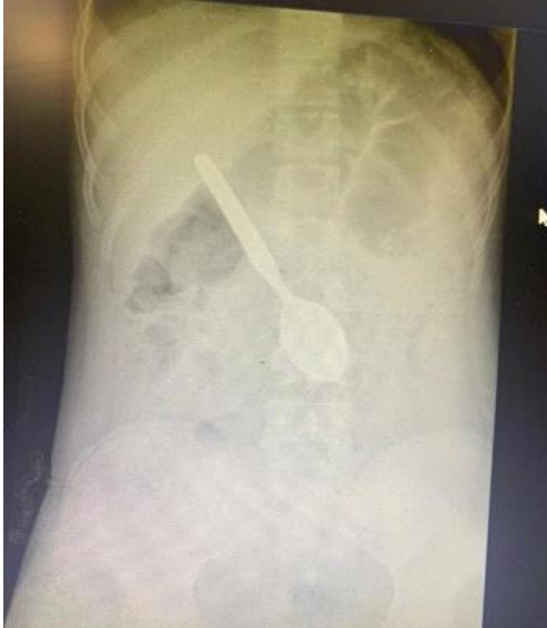
Figure 1: Patients first X-ray taken with the spoon visible

A 16-year-old male patient was referred to the pediatric emergency service with complaints of discomfort and restlessness. He was not mentally healthy enough to explain his complaints or history. The family stated that he has been in discomfort for the last 10 days and had clear abdominal pain for the last 2 days. There was nothing suspicious in his history. Physical examination revealed abdominal tenderness, defense, and rebound. There were no findings in laboratory tests. The patient was sent for a Direct Abdominal X-Ray (Figure 1), which revealed a spoon in the duodenal region.