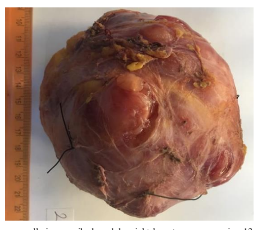
Figure 1: Large, well-circumscribed, nodular right breast mass measuring 13x11x5 cm in size on physical examination

Due to the rapid growth and progressive deformation of the breast, lumpectomy was recommended, and surgery was performed without any perioperative and postoperative complications, considering the stage of the pregnancy. Pathological examination reported the tumor size as 13x11x5 cm (Figure 1). Histopathological examination of the mass was compatible with fibroadenoma with increased stromal tissue, and cellularity and proliferation in epithelial cells (Figure 2). Safety of the fetus was ensured by perioperative and postoperative follow-up. At the third month follow-up, bilateral breasts were symmetrical and wound healing was rapid without any infection or complications. Written informed consent was obtained from the patient.