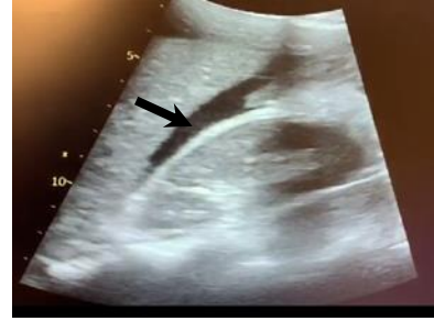
Figure 2: Free fluid in the hepato-renal cavity (arrow)