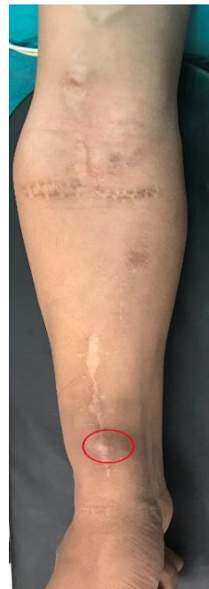
Figure 1: A preoperative image of surgical scars and swollen radial pseudoaneurysm in the right forearm (red circle)

Skin incision was performed under local anesthesia and the pseudoaneurysm sac was reached. The radial artery, released from the proximal and distal ends, was rotated, and clamped after intravenous administration of heparin 80 IU/kg. The arterial continuity was disrupted in the distal segment. Dissection was performed and a vascular clamp was placed to the distal segment. The pseudoaneurysm sac was then excised. Specimens from both solid and fluid material inside the sac were collected for pathological and microbiological examination. As the proximal and distal ends of the radial artery were unable to be repaired in an end-to-end fashion, saphenous vein graft interposition was performed (Figure 3). The vascular clamps were released, and it was observed that radial artery was pulsatile with adequate microcirculation on palpation. No microorganism was isolated in the culture. Clinical diagnosis was confirmed by the pathological examination. The patient was uneventfully discharged from the hospital on postoperative day 2.