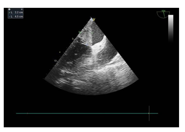
Figure 1: Transesophageal echocardiogram showing mass (42x22 mm) in the left atrium adhering to the posterior region that extended towards the mitral valve, suggestive of a myxoma