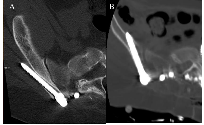
Figure 3: Iliac screw causing lateral wall injury (A), An iliac screw that was seen causing medial iliac wall injury (B)

In groups 1 and 2, two and one screw loosenings were observed, respectively. No statistically significant difference was found (P=1.00). There was no screw breakage in either group.