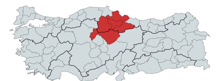
Figure 1: The provinces with Turkish Baths where fungal samples were collected

In our study, thirty nine fungi were isolated from two hundred and forty samples of nine Turkish hammams. The provinces where the Turkish Baths where fungal specimens were collected are shown in Figure 1. Microscopic views of fungal specimens collected from Turkish baths are shown in Figure 2. Among the isolated fungi species, molds were the most common. The isolated molds were as follows: Aspergillus spp. (n=20), Scedosporium apiospermum/boydii (n=5), Alternaria ulocladium (n=2), Rhizomucor spp. (n=1) and Penicillium spp. (n=1). As yeasts, Trichosporon spp. were detected in six samples, Candida albicans in one sample and Candida tropicalis in one sample. As a dermatophyte, Trichophyton tonsurans was isolated in two samples. Among personal tools, fungi were most commonly isolated from slippers, and not at all detected in towels and peshtemals used in hammams.