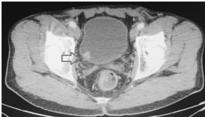
Figure 1: Computed tomography scan showing heterogeneously enhancing bladder mass (arrow)

Ultrasonography (USG), intravenous pyelography (IVP), computed tomography (CT) and magnetic resonance imaging (MRI) are major methods used for radiological evaluation of bladder leiomyomas. Leiomyoma is usually observed as homogeneous, hypoechoic and clearly bordered in USG and has small amount of hemorrhage in Doppler USG [16].