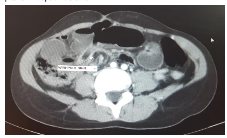
Figure 2: The whirl sign and a double bird's beak sign due to the mesenterico-axial volvulus.