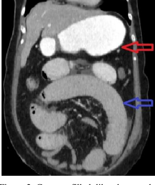
arrow) on coronal reformatted CT section

The patient was diagnosed with Spigelian hernia with current clinical and imaging findings, and surgical intervention was decided. Primarily, laparoscopic surgery was tried, but the intestine was not reduced. Open surgical intervention was then performed, and the defect was covered with a mesh after the intestine was reduced. There was no necrosis of the intestine in the hernia incision, and no resection was needed because peristalsis of the intestine was observed (Figure 3). The patient, who could be fed orally on the 2nd postoperative day and had gas and fecal discharge, was discharged on the 4th postoperative day. There were no adverse effects in the control examination performed on the 10th postoperative day.