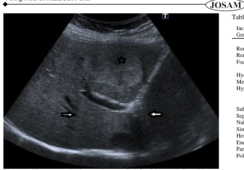
Figure 1: Ultrasonography image shows well-defined hyperechoic solid mass (asterisk) in liver parenchyma. Posterior acoustic enhancement (arrows) is typical for hepatic hemangiomas.