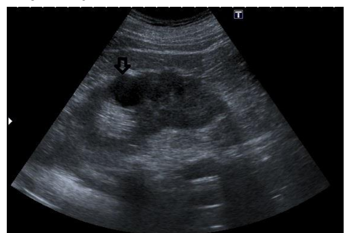
Figure 2: A hypoechoic cystic lesion (arrow) is seen upper pole of left kidney without any solid component or septa (simple cortical cyst).