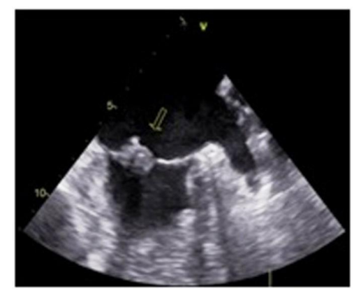
Figure 1: Vegetation on mitral valve

One month after prostate biopsy, he admitted to our clinic with complaints of fatigue, severe back pain, fever and night sweats. Transthoracic echocardiography (ECO) was performed because of fever and murmurs and revealed slightly thicker aortic valves prolapse with proliferation of tissue in mitral anterior leaflet and moderate to severe mitral insufficiency. Second echocardiography was performed because of Enterococcus faecalis growth in 4 consecutive blood cultures and 1 urine culture in fever periods and found similar with the previous one. Brucella agglutination test, tuberculin skin test and bone scintigraphy were negative which were done for fever and back pain. Oral levofloxacin treatment was completed to 14 days and patient was discharged from hospital.