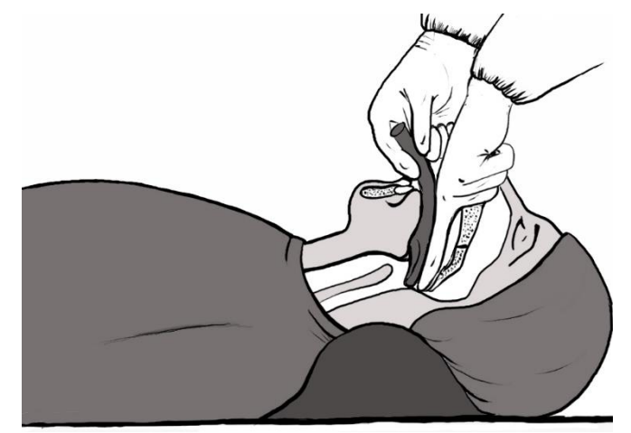
Figure 3: Directing the tip of the cLMA to caudally by the index finger of the non-dominant hand