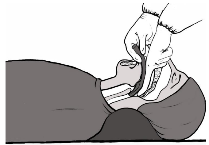
Figure 4: Advancing the cLMA over the index finger to its final position