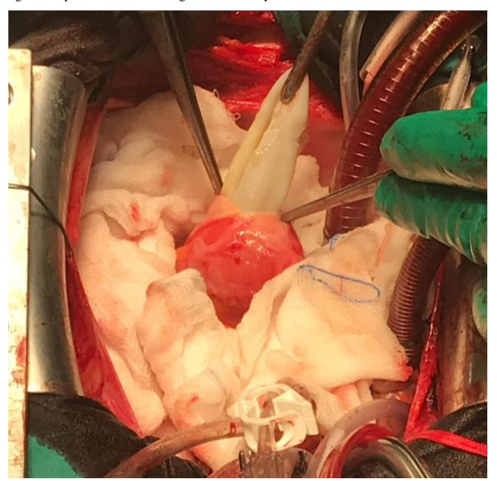
Figure 4: Operative view of the right ventricular cyst.