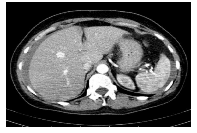
Figure 2: Hepatorenal fluid

After the urinary catheter was inserted in the emergency room, the patient's abdominal pain gradually increased. In addition, a rapid decrease was observed in the hemogram values of the patient after urinary catheter insertion. The patient's vital signs were aggressively impaired. We were consulted after the patient was found to have an 11 cm solid mass, which may have originated from the ovary. During the physical examination of the patient, the entire abdomen was tender, and rebound and defense were detected. Based on the pelvic examination, the cervix was normal, and the Douglas cavity was found to be involved with tumor tissue. Abdominal ultrasonography (USG) and transvaginal ultrasonography (TV-USG) revealed diffuse fluid in the hepatorenal and splenorenal areas (Figure 2). A 11 x 10 x 10 cm solid mass formation with irregular borders was observed in the pelvic region (Figure 3).