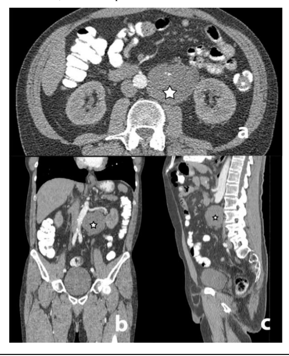
Figure 1: IV and oral contrasted abdominal CT examination of the patient a) On an axial section, solid mass lesion (star) with a smooth contour and millimetric calcifications is seen adjacent to the left iliac muscle and aorta in left pararenal fatty plans b) On the coronal section, the close relationship of the lobulated contoured lesion with the left kidney and renal vascular structures is observed (star) c) On the sagittal section, although the mass (star) was in the paravertebral area, its relationship with the nerve roots could not be visualized on CT.

A smoothly contoured iso-hypodense solid mass lesion sized 52x48x68 mm (APxTRxCC) was detected in the left retroperitoneal area at the level of L2-L3 vertebral corpora within the paravertebral-perirenal fatty plans on intravenous and oral contrast-enhanced abdominal CT examination (Figs.1a, 1b, 1c). After the contrast injection, the lesion did not show significant contrast enhancement. Nonspecific millimetric calcifications were observed within the internally homogenous lesion. The lesion showed a close relationship to the left renal vascular structures in its anterior segment, and abdominal aorta medially, but had no obvious invasion findings. In addition, the boundaries between the left kidney and the iliac muscle could be selected clearly. The lesion had no connection with intraabdominal formations but mildly extended towards the vertebral column in the anteromedial-inferior part. Neural foramen or spinal canal extension of the lesion could not be differentiated on CT in sagittal, coronal, and axial plans in multiplanar examinations. A percutaneous CT-guided biopsy of the mass was performed, and histopathological examination was consistent with a retroperitoneal schwannoma.