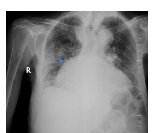
Figure 1: Chest X-Ray revealed a suspicious mass image in the right paracardiac area