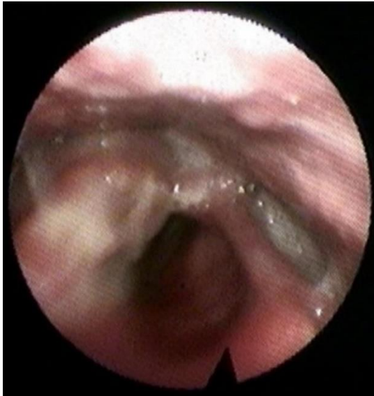
Figure 1: Flexible fiberoptic view of the larynx

After obtaining patient consent, direct laryngoscopy was performed under general anesthesia. On the laryngeal face of the epiglottis, there was a mass extending from the right epiglottic fold to the root of the tongue. A biopsy was obtained.