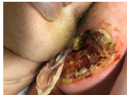
Figure 4: After debridement, vacuum-assisted closure application and suture application