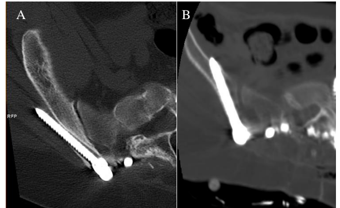
Figure 3: Iliac screw causing lateral wall injury (A), An iliac screw that was seen causing medial iliac wall injury (B)

In groups 1 and 2, two and one screw loosening were observed, respectively. No statistically significant difference was found ( P =1.00). There was no screw breakage in either group.