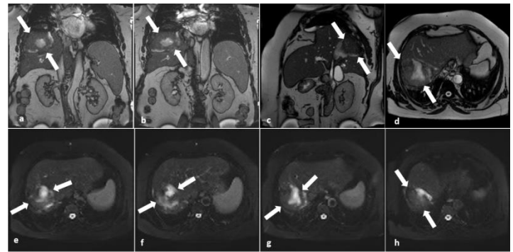
Figure 1: In the magnetic resonance cholangiopancreatography images; the coronal T2 (a, b), sagittal T2 (c), axial T2 (d) and fat-suppressed axial T2 (e-h) sections for liver; in the right lobe posterior superior segment; a mass lesion with solid components (arrow) of 76x70x65 mm diameter, heterogeneous intensity, with no borderline clearance, hyper-intense cystic T2A images, isointense with liver parenchyma was observed.

Lesion with a diameter of approximately 70x65x76 mm, with hyper-intense and isointense components, no definite boundaries were observed in T2A weighted images, in liver segment 6-7 on MRI and MRCP (Figure 1). Continuation of right intrahepatic bile ducts was not observed due to the pressure of lesion. The lumen was slightly prominent in the traceable segment of approximately 7 mm. Intrahepatic bile ducts were dilated in segment 6-7 due secondary pressure of lesion. The intrahepatic main bile ducts were normally wide on the left. The diameter of the choledochus was measured approximately 9 mm at its most prominent location and was dilatated. The gallbladder was hydroptic in appearance and had a transverse diameter of approximately 48 mm, with no mass occupying the lumen. The pancreatic duct was normally wide (Figure 2). In laboratory, total bilirubin was 0.7 mg/dL and alkaline phosphatase was 113 IU/L. Gamma glutamyl transferase was 41.9. There was no abnormality in the hemogram examination. The case that we presented continued the follow-up and treatment in the university hospital. While preparing the case report, we informed the patient and obtained the consent.