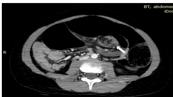
Figure 2: Axial abdominal CT image showing a distended gas-filled colonic loop and the whirlpool sign (twisting of the mesentery and vessels: arrow) suggestive of sigmoid volvulus.