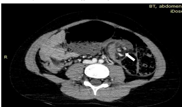
Figure 3: Axial abdominal CT image showing a distended gas-filled colonic loop and the whirlpool sign (twisting of the mesentery and vessels: arrow) suggestive of sigmoid volvulus.