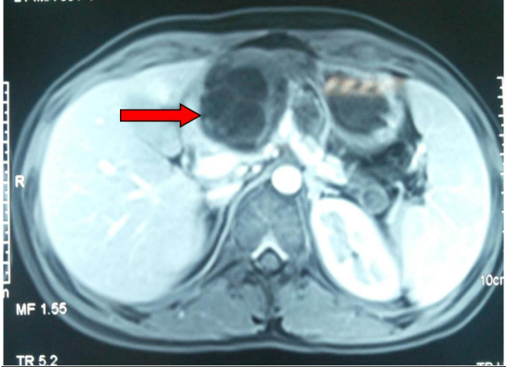
Figure 2: Magnetic resonance imaging of the hydatid cyst occupying the body of the pancreas

On the other hand an abdominal magnetic resonance imaging shows of a mass of the pancreatic isthmus of 5 cm clearly communicating with the wirsung which is dilated at the level of its corporal-caudal part measuring 16 mm of diameter, no fleshy bud either in the mass or in the wirsung this aspect is in favor of a mucinous intra-papillary tumor of the pancreas without signs of degeneration (Figure 2).